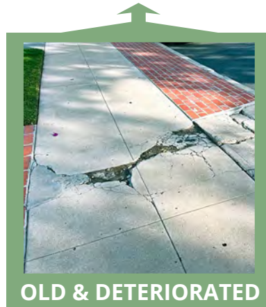
OLD & DETERIORATED

Note: Photos shown above are examples of damaged sidewalks and do not convey all potential conditions.