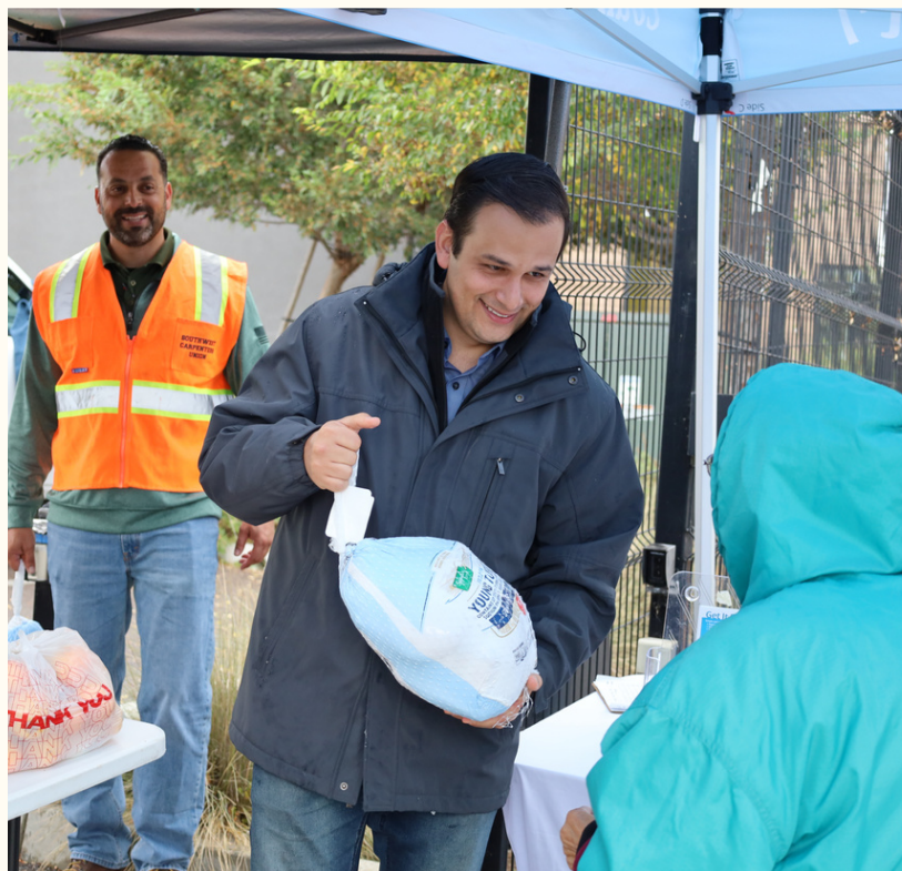
Clockwise from top left: San Carlos Library “We Bought the Lot” event, ribbon cutting for the first solar panels installed as part of the San Diego Solar Equity program, Linda Vista Thanksgiving turkey giveaway event, ribbon cutting for Union Grantville housing complex.