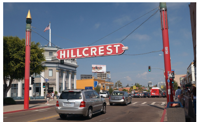
The Hillcrest Business Improvement District is the most prominent business district in the Uptown community.