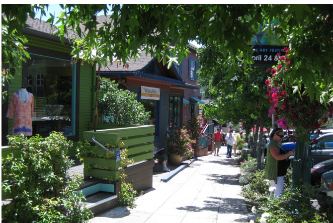
Street trees and landscaping attract pedestrians and help support vibrant commercial districts.

Many ongoing targeted economic revitalization efforts in Uptown involve partnerships between residents, property owners, community groups, business organizations and the City. The City's Economic Development Department and the Planning Department will continue these partnerships with the objective of improving the economic prosperity of Uptown. The small businesses in Uptown are unique and economic revitalization and assistance through private\public partnerships will also continue for this major component of Uptown's economy.