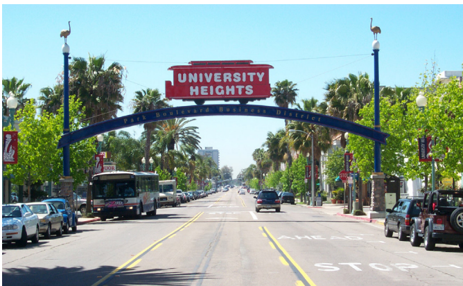
Maintenance assessment districts provide special benefit services that could include installation or maintenance of open space, street medians, street lighting and mini parks.

A BID works to unify the businesses within a particular district to work toward a common goal of economically revitalizing their business district. This is typically done through marketing programs, civic beautification projects, commerce recruitment, and parking and transportation improvements. Current, economic development strategies that all BID associations provide are: organized special events, social media marketing, and membership communication.