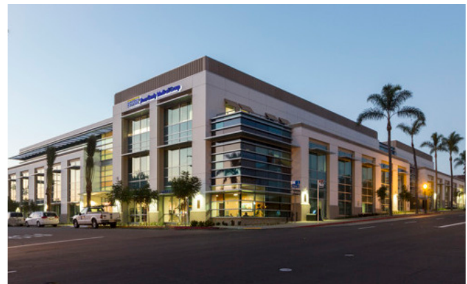
Medical uses are located along the major north-south corridors of Bankers Hill/Park West neighborhoods.