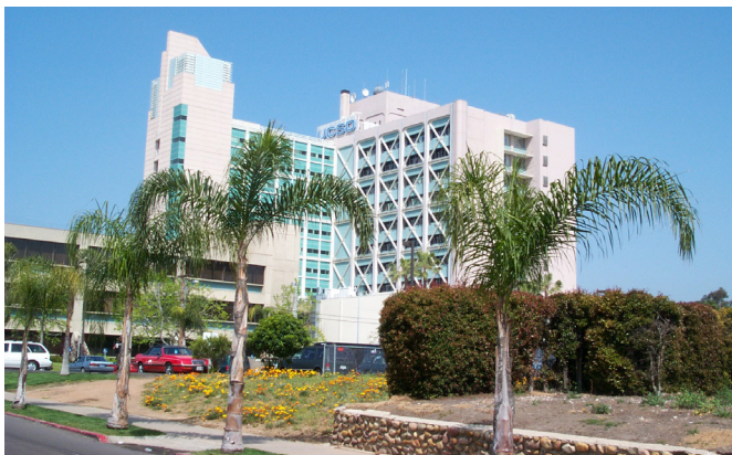
UCSD Medical Center is one of the largest employers in the Uptown Community.