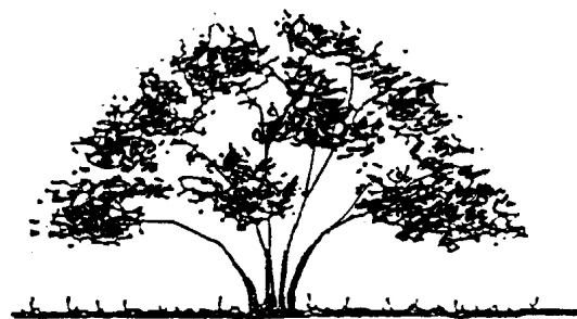
Chaparral Plant After Pruning

Step 4: Dispose.... of the cuttings and dead wood by either hauling it to a landfill; or, by chipping/mulching it on-site and spreading it out in the Zone 2 area to a depth of not more than 6 inches.