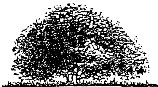
Chaparral Plant Before Pruning

Remaining plants, 4 feet or more in height, should then be cut and shaped into "umbrellas." This means pruning one half of the lower branches to create umbrella-shaped canopies. This allows you to see and deal with what is growing underneath. Upper branches may then be shortened to reduce fuel load as long as the canopy is left intact. This keeps the plant healthy and the shade from the plant canopy reduces weed and plant growth underneath. Vegetation that is less than 4 feet in height, like coastal sage scrub, should be cut back to within 12 inches of the root crown.