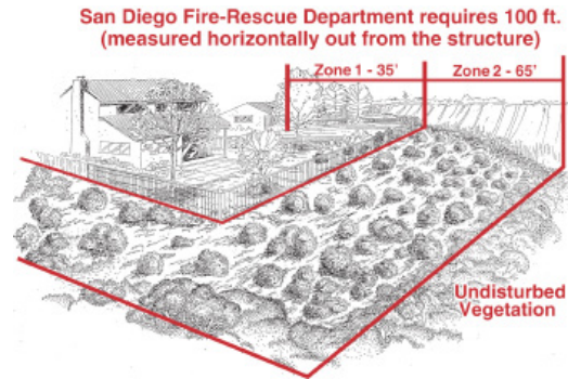
After Thinning and Pruning

Step 3: Prune.... all plants or plant groupings that are left after the thinning process to achieve the horizontal and vertical clearances shown in the illustration below. (For trees in Eucalyptus Woodlands areas, see FPB Policy B-08-1.)