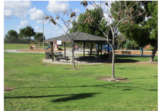
Westview Neighborhood Park