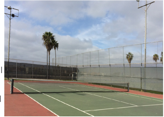
Santa Clara Point

As noted in previous sections of this document, the assessment team reviewed and assessed a total of 235 parks throughout the Greater San Diego area, in accordance with the scope developed with the City. The assessment teams covered a total of 112,801,312 gross square feet (2,590 gross acres) of developed park areas, with a total estimated Plant Replacement Value (PRV) of $1,968,172,155 for the developed areas. Maintenance and capital backlogs for the 235 parks totaled $212,990,379. Using the PCI ratings developed for the parks, the 235 parks assessed received a rating of 11, indicating that the facilities are in an overall “Good” condition. Of these 235 facilities, 178 received a rating of “Good” (PCI 0-20), 30 received a rating of “Fair” (PCI 21-29), and 27 received a rating of “Poor” (30 or greater).