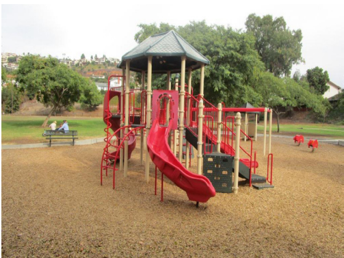
Princess Del Cerro