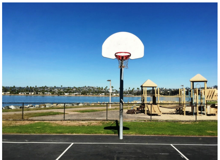
De Anza Cove