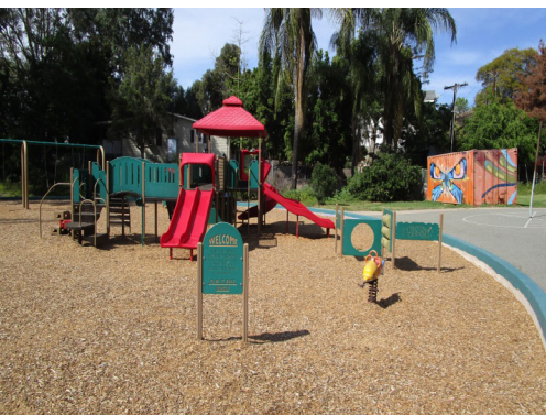
Azalea Neighborhood Park