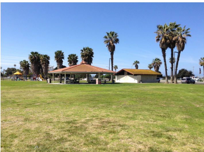
Dusty Rhodes Neighborhood Park

The table below illustrates the average useful life expectations for the park systems used in the assessment. As each park system is made up of multiple elements, the age shown represents the highest occurring element within the system, based upon site observations of the park area assessed. For example, within parking lots, the overwhelming majority of the hardscape observed was asphalt paving, with only minor portions of concrete paving and curbs (if present). Therefore, the useful life expectation for parking lots was based on asphalt concrete rather than standard concrete.