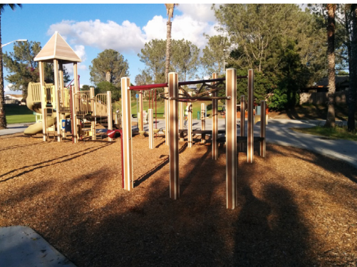
Winterwood Lane Neighborhood Park