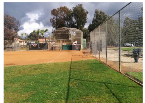
Jerebek Neighborhood Park