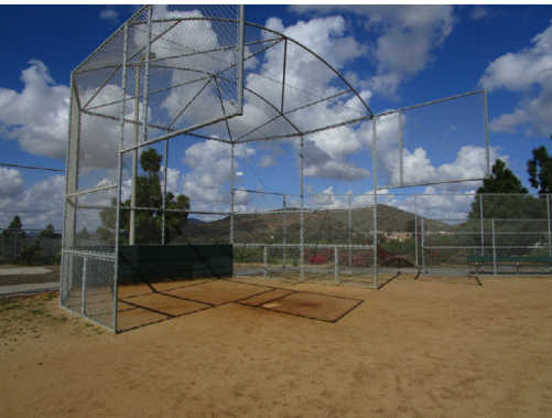
Westview Neighborhood Park