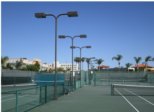
City Heights Community Park