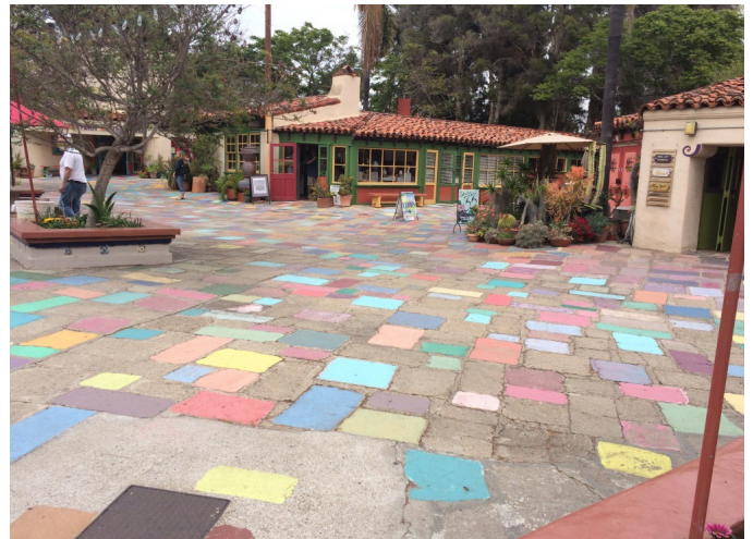
Balboa Park - Central Mesa