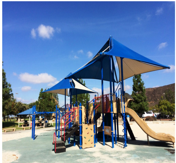
Hilltop Community Park