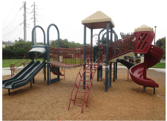
Silver Terrace Mini Park

For the parks included in this assessment, 112,801,312 gross square feet (2,590 acres) were assessed. The Plant Replacement Value for the developed areas for the 235 parks assessed is $1,968,172,155. Individual park PRV's are included in the park amenity assessment reports for each park.