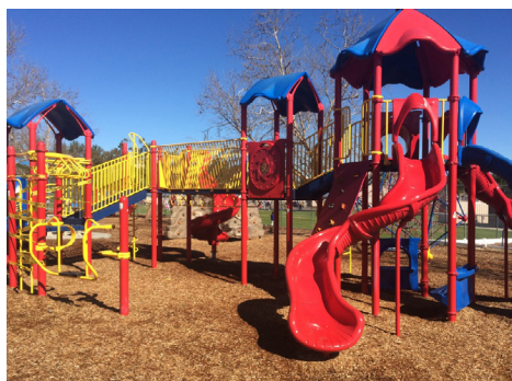
Highland Ranch Neighborhood Park