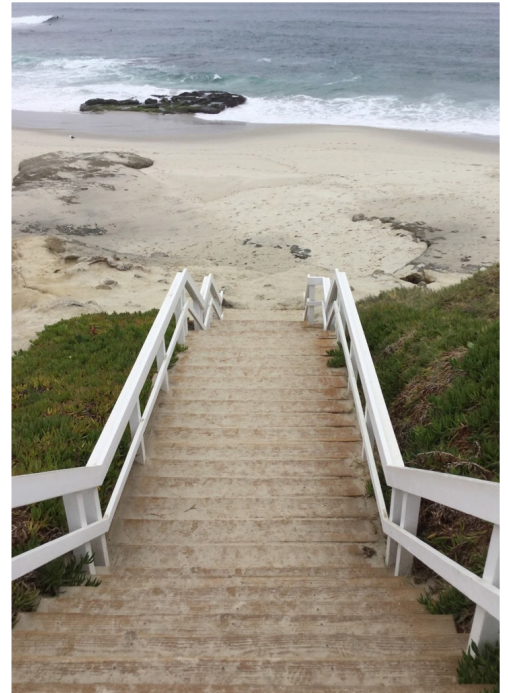
Windansea Beach Park