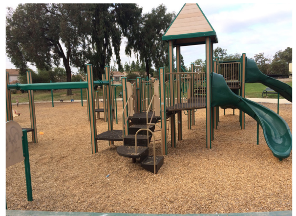
Mesa Verde Neighborhood Park