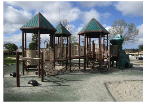
Oak Neighborhood Park

The overall primary goal of these assessments was to identify the current park-related maintenance and capital backlogs, and to forecast anticipated future capital renewals for site systems. Other work to achieve this goal included the research and review of available as-built drawings, general development plans and other available information from the City staff. The information contained within this report will be used to assist City staff in planning for park maintenance and capital renewal, for both current backlogs and future park concerns (for the next 20 years).