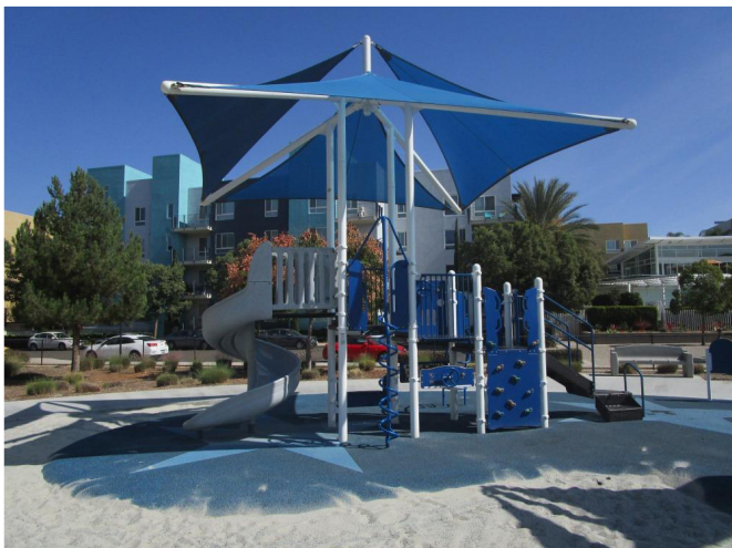
Centrum Neighborhood Park

The following table and figure illustrate the average PCI for the parks based on the facility age (Decade Built). With some limited variations, the year used to determine the park age was either provided directly by the City, or was taken as the “Initial Development” year listed on the park GDP. Overall, the average PCI for parks grouped by decade fell within the “Good” range (PCI 0-20).