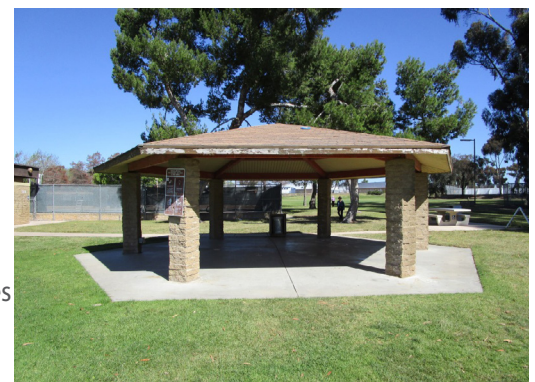
Standley Community Park

As a part of the Reliability Level categories, "Site Development: Playgrounds" have been assigned to Reliability Level 1: Operations Impacts, and "Parking Lots" to Reliability Level 2: Deterioration. The City should begin developing an action plan to address conditions that could put the City at some liability or risk, and decide to either repair or replace the system elements that are beyond their useful life. "Site Development: Playgrounds" are included in Reliability Level 1: Operations Impacts, and are not only crucial to the mission of the parks but may put the City at higher risk due to extended deterioration or potential failure, even though the City ensures the playgrounds are safe. As old play equipment is removed due to age, the play value of the park diminishes resulting in fewer park users thus reducing the park's ability to achieve the City's park mission. We recommend that the City focuses on the playground system first.