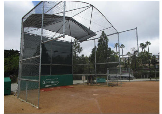
Ashley Falls Neighborhood Park

The cost estimates, the backlog of maintenance, and capital backlogs identified in the facility assessment reports were prepared by Kitchell’s estimating department using data from real-time, field-verified construction estimates. The estimates include applicable direct cost and City Cost Index (CCI) adjustments for performing the work, and additional adjustments requested by the City to bring direct costs in line with the City’s historical costs for work. Also included are soft costs the City typically applies to administer, design, manage, regulate, and execute the work performed on the facilities. The soft cost factor used for the FY-2019 assessment was set at 1.50 for the purpose of determining the maintenance and capital renewal deficiency cost estimates.