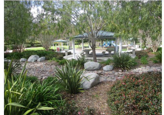
Carmel Knolls Neighborhood Park