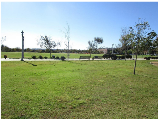
Naval Training Center

Figure 2. Total Backlog by Park Systems - All Parks