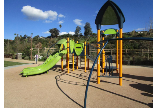
Charles Lewis Memorial Park