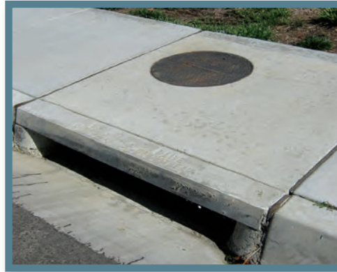
Drainage Insert (Curb Inlet)

Minimum Required Inspection/ Maintenance: Inspect before and after the rainy season (October-May) and after each storm event. Clean/repair/replace as needed to ensure proper function. Replace oil absorbent pouch as needed (when the filter media turns grey or black).