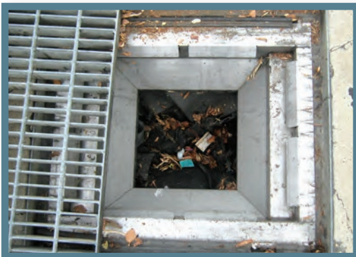
Drainage Insert (Area Inlet)