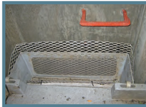
Drainage Insert (Curb Inlet)