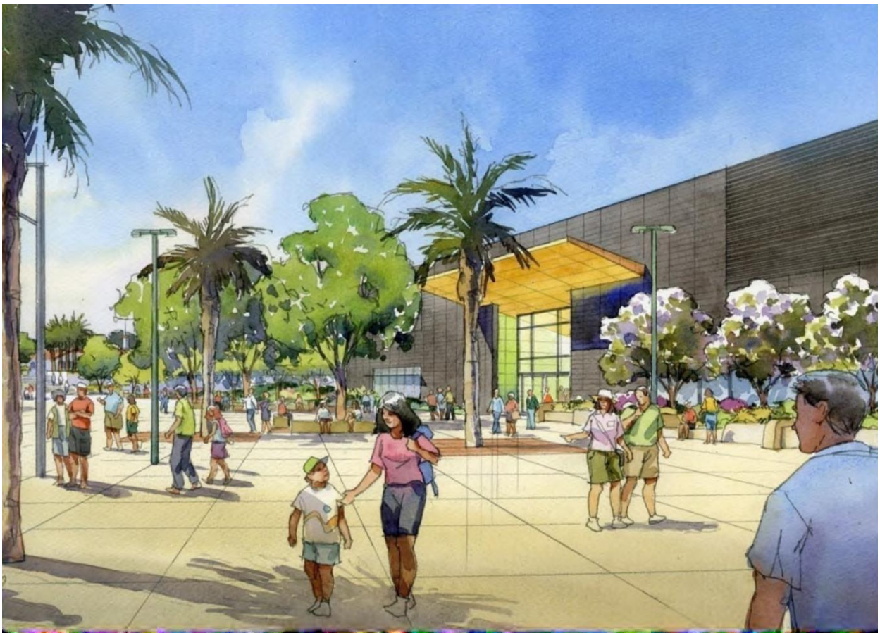
San Ysidro Land Port of Entry