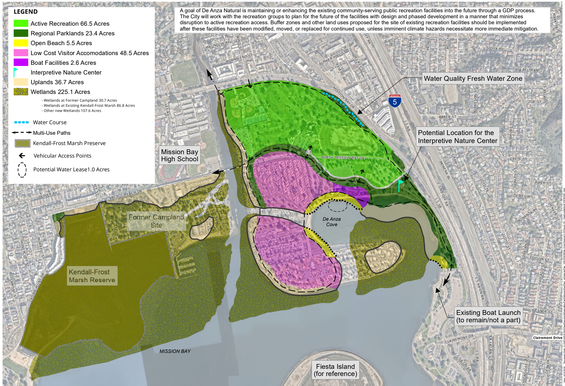
De Anza Natural De Anza Cove Amendment to the Mission Bay Park Master Plan Figure 3: Site Plan