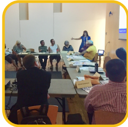
Identify case studies.