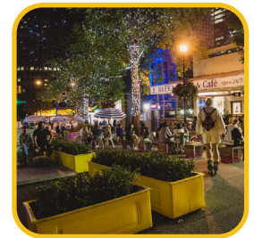
Reflective of Community Needs and wants