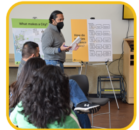
Create the framework for streamlined processes.