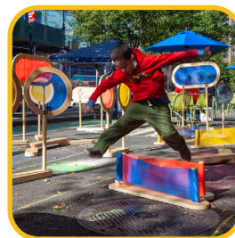
Quick to Implement