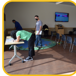
Conduct mapping and gap analysis.